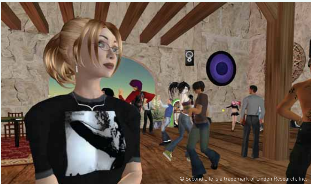
© Second Life is a trademark of Linden Research, Inc.

Second Life has a list of resources including an education mailing list, which gives teachers an opportunity to share information. There is also a Second Life Education Wiki: www.simteach.com/wiki/index.php?title=Second_Life_Education_Wiki .