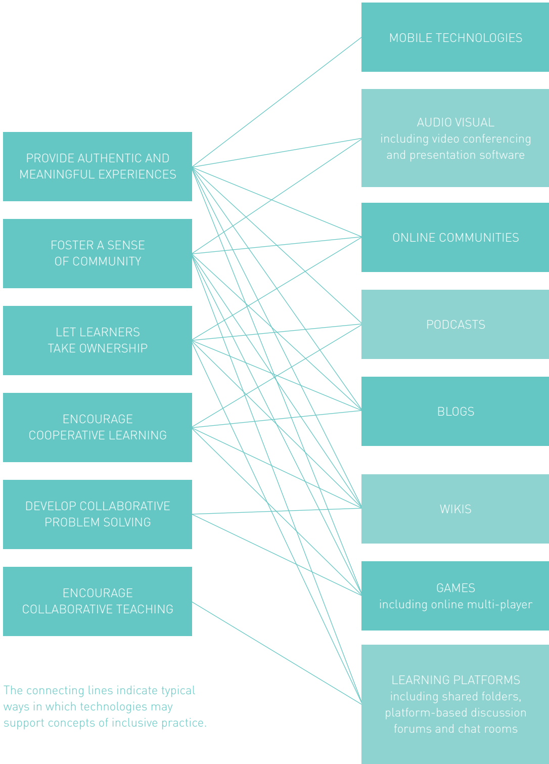
DIAGRAM 1: EXAMPLES OF HOW TECHNOLOGIES MAY SUPPORT INCLUSIVE PRACTICE CONCEPTS HIGHLIGHTED IN SECTION 2

Section 5 (the directory) has details on where to go to find out more about using these technologies.